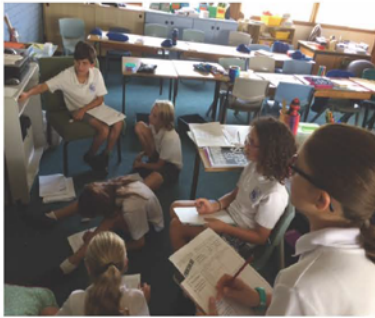
Super 6 Group work

We have had a busy start to the term. Pictures tell a thousand words!